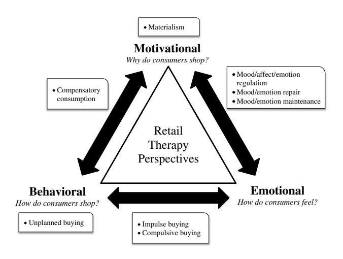
Figure 2.2: Retail therapy and its related constructs.

2014; Larsen, 2000]. Given that affect , or an internal feeling state, can take the form of either moods (that is, low intensity and diffuse affect whose source is often unidentified) or emotions (that is, more specific and differentiated affective states), the corresponding and arguably more precise terms mood regulation and emotion regulation are often used in the literature. Even more specifically, the term mood (emotion) repair has been used to refer to the attempt to improve one's negative moods (emotions), whereas mood (emotion) maintenance denotes endeavors to sustain or prolong one's positive moods (emotions) [Gross, 1998; Isen, 1984]. Individuals repair their negative affect by using a variety of strategies [Forgas, 1995; Gross, 2014; Josephson et al., 1996; Parkinson and Totterdell, 1999; Thayer et al., 1994], which include shopping and buying.