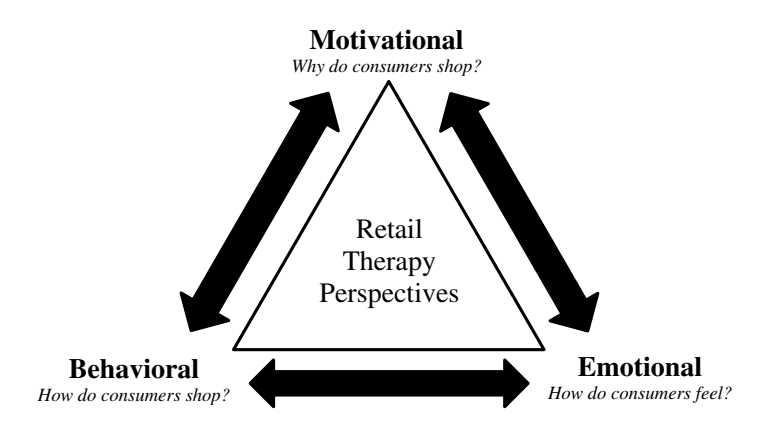
Figure 1.1: A tripartite framework for examining the effectiveness of retail therapy.

3. Emotional — More specifically, I consider shopping as a hedonic experience that triggers a variety of emotions. The incidence (or lack) of these specific emotions when consumers shop is examined.